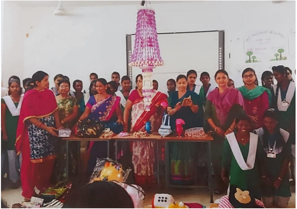
Handmade chandelier/ Jewellery in collaboration with ITI Koni Bilaspur