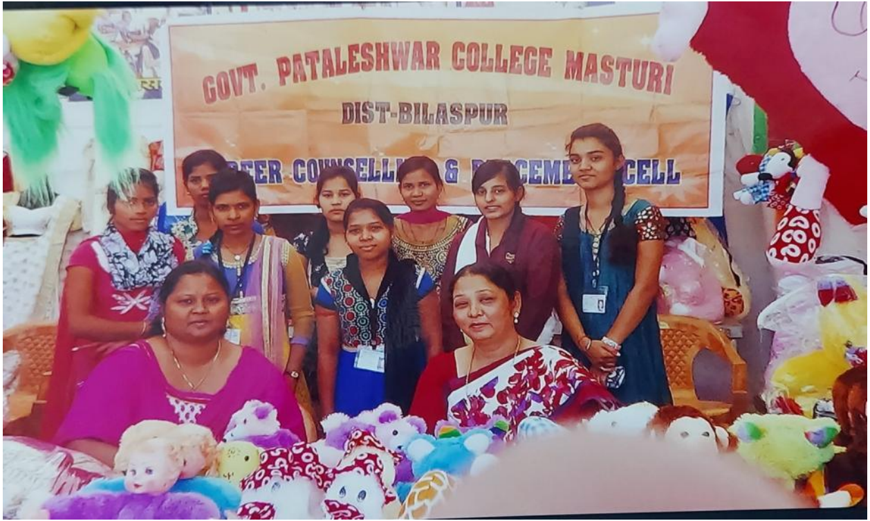
Exhibition of handmade products at Bilaspur city Industrial Trade Fair 2017