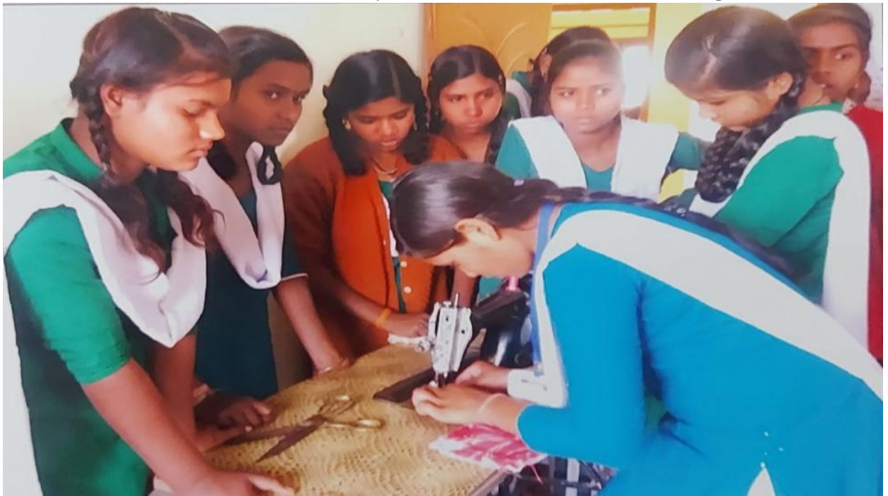
Hand Bag making training to Pratham School Girls Masturi