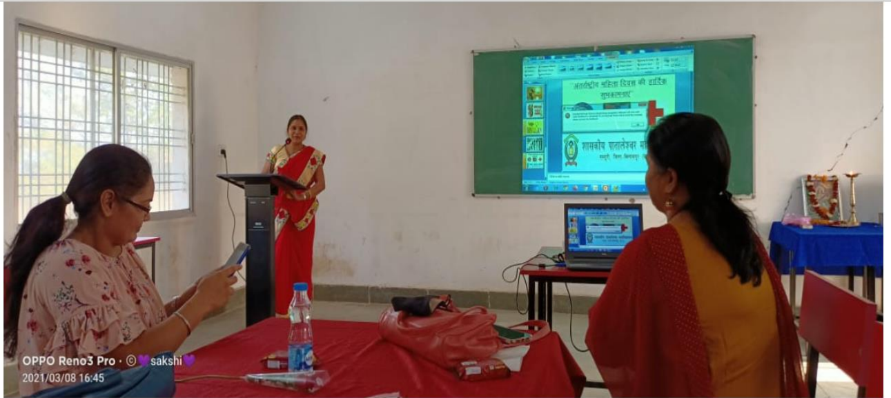
“International Woman’s day celebration” at Government Pataleshwar College Masturi on 8th March 2021, Theme of the programme was “ MERI KAHANI MERI ZUBANI ” Participants shared their struggle of success....