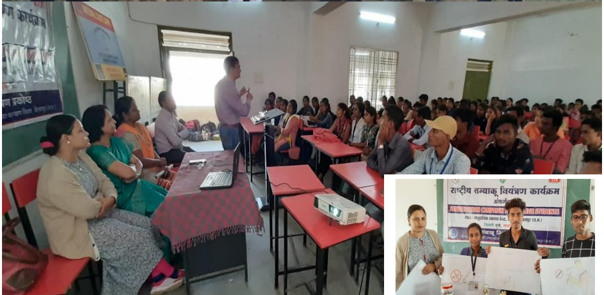
GENDER BUDGETING (GB)