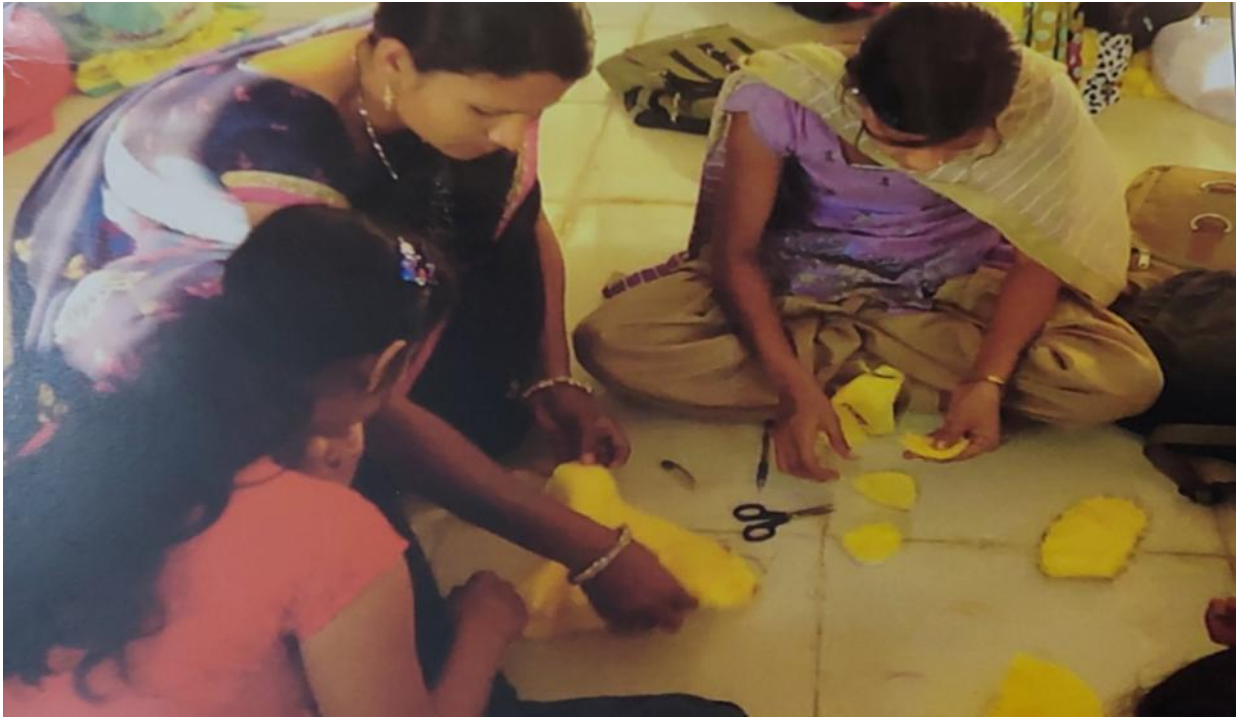
Soft toy making by college students