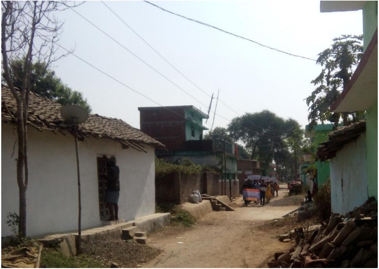
Awareness Rally 'Beti Bachao Beti Padhao' in nearby village

importance in nation building as well as awareness regarding female foetus examination as legal offence.