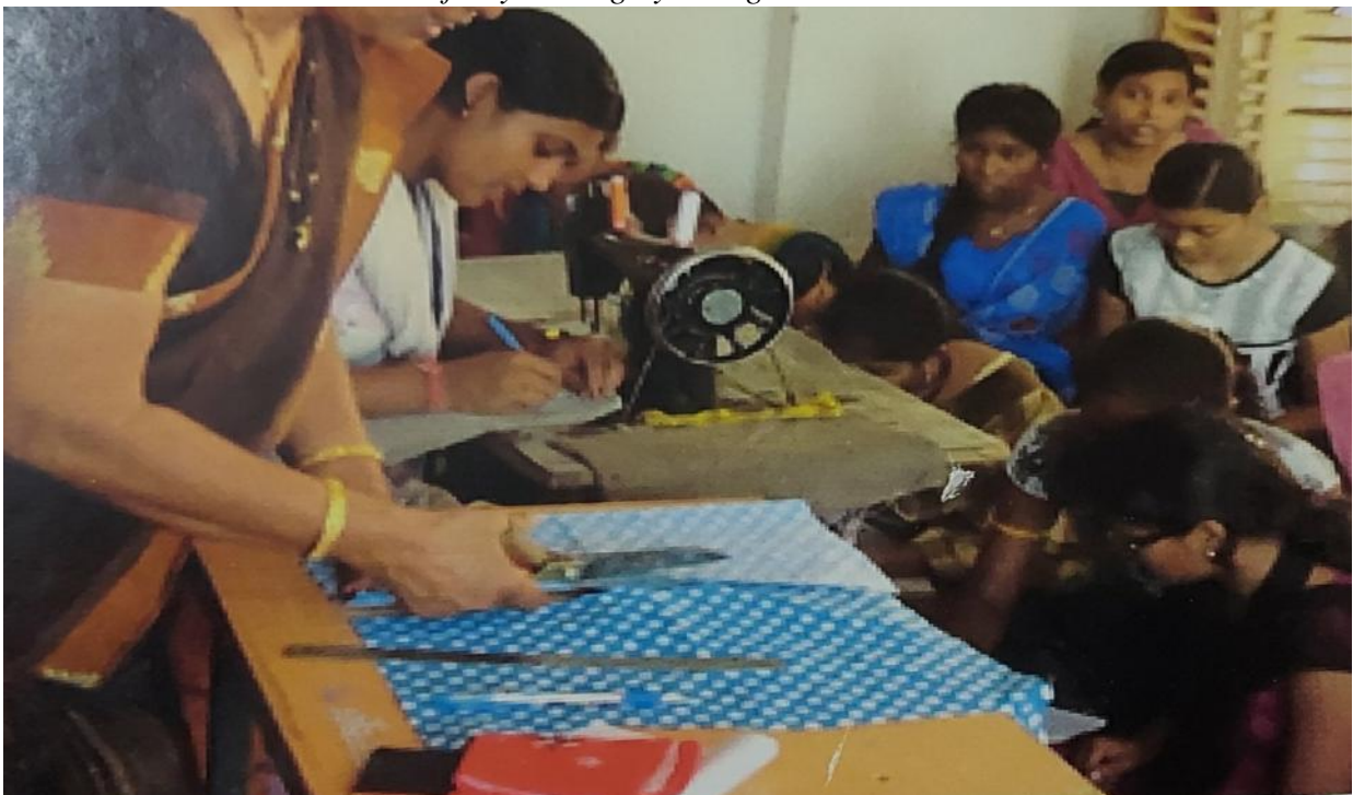
Cloth bag making in collaboration with Mahila ITI, koni, Bilaspur