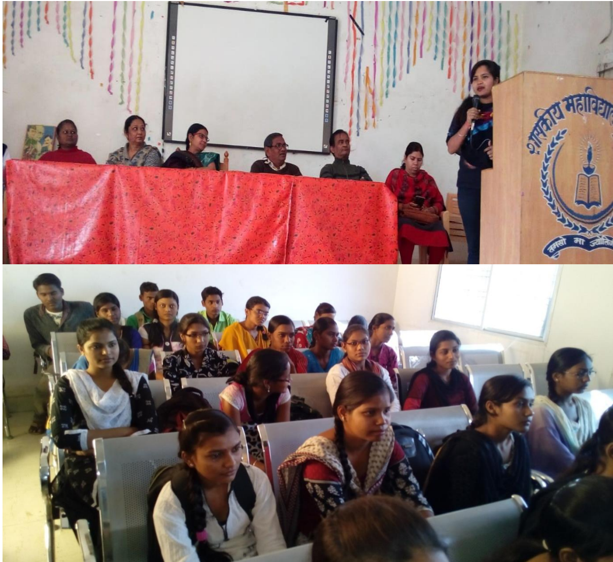
International Women's Day Celebration "Meri Kahani Meri Zubani March 8, 2020

and how she brought women out of seclusions to fight for the freedom of Nation. She propagated about youth welfare, civil rights and women emancipation openly. She was sobriqueted as 'Bharat Kokila' by M K Gandhi and awarded Kaiser-i-Hind medal for her service during flood relief in Hyderabad which but she returned it in protest over Jallianwala Bagh massacre. Students were highly inspired with her audacity and heroism.