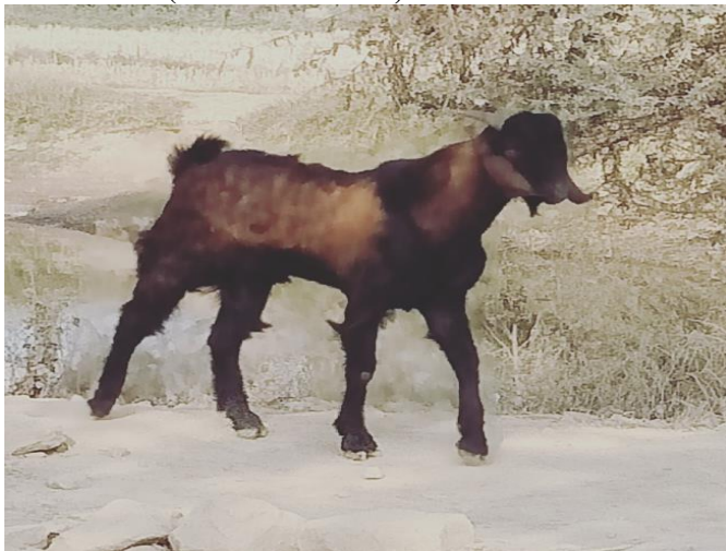
Goat ( Capra aegagrushircus )