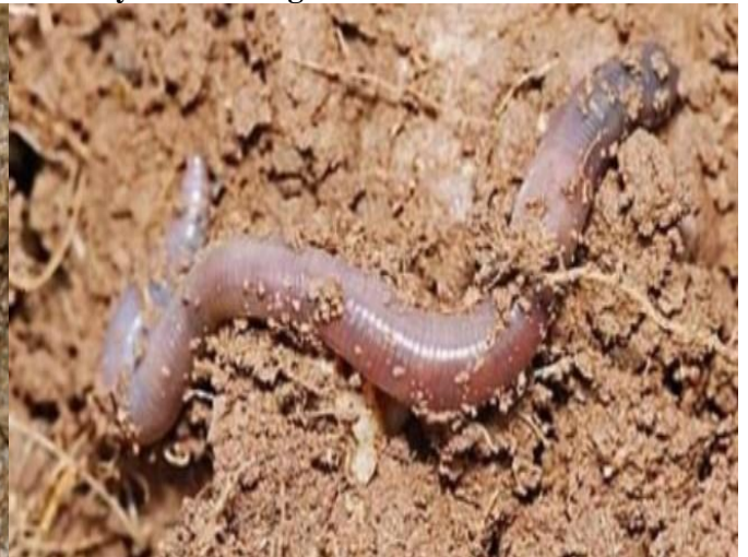
Earthworm ( Pheritimaposthuma )