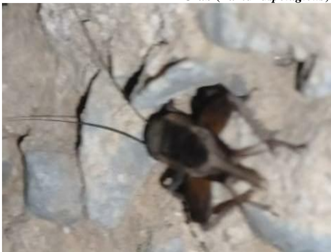
House cricket ( Acheta domestica )