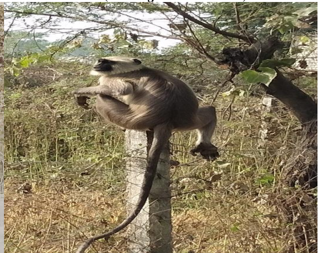
Monkey ( Semnopithecusposthuma )