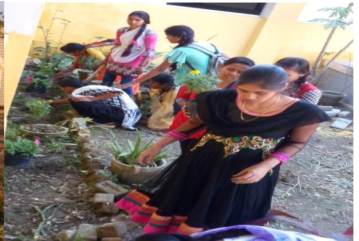
Fig. 2-7 Plantation in the College campus by Zoological Club