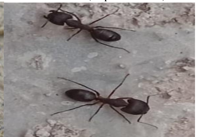
Ant ( Formica rufa )