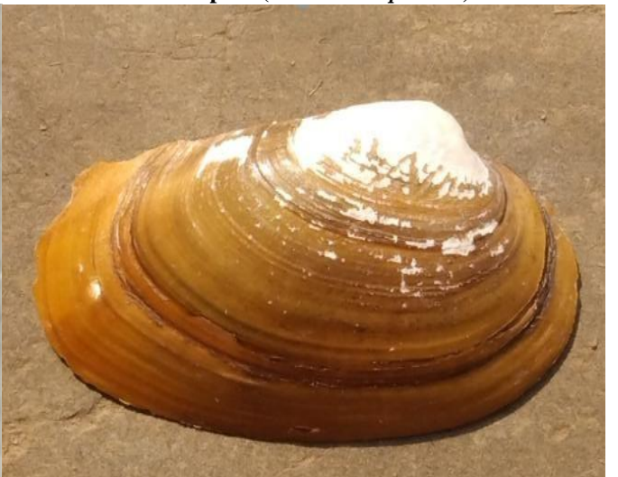
Unio ( Uniocariel )