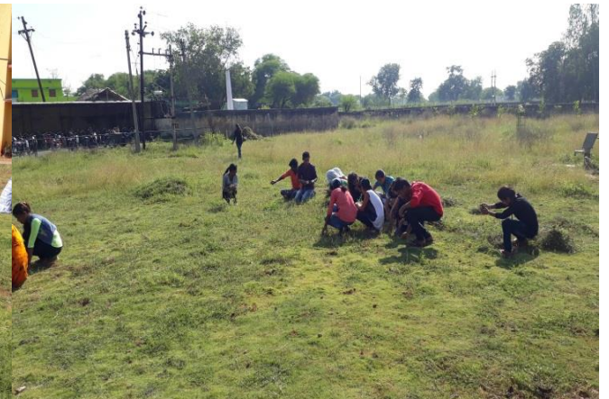
Fig. 8-9 Garden maintain by NSS and Zoology club