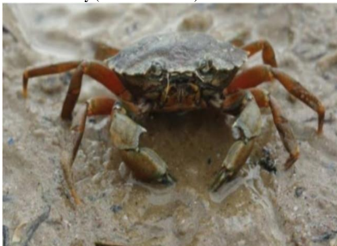
Crab ( Portunus pelagicus )