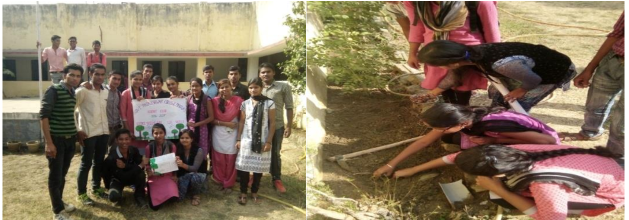
Fig.12-13 Environment Awareness by Science Club