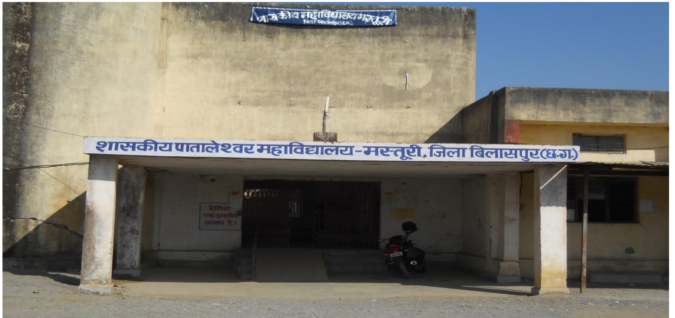
Fig. 1 Government Pataleshwar College, Masturi (Administrative Block)