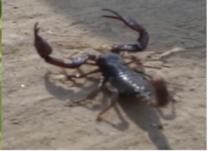
Scorpion ( Pandinusimperator )