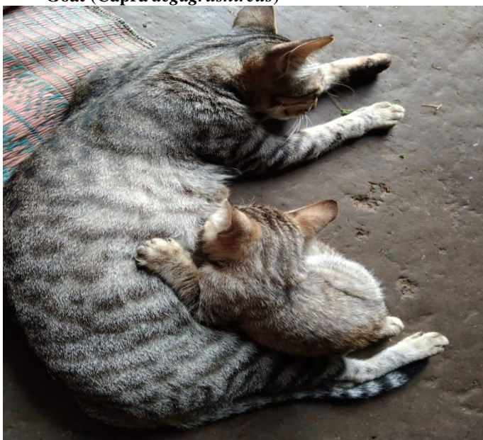
Cat ( Feliscatus )