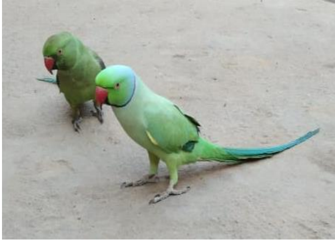
Parrot ( Psittaculakrameri )