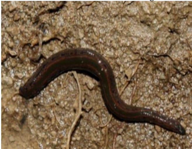
Leech ( Hirudomedicinalis )