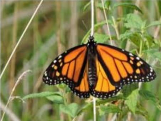
Butter fly ( Morphofabricus )