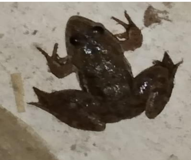
Frog ( OccidozygoLima )