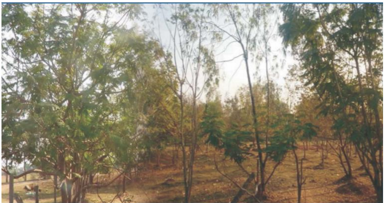
Fig. 14 Green campus of our College