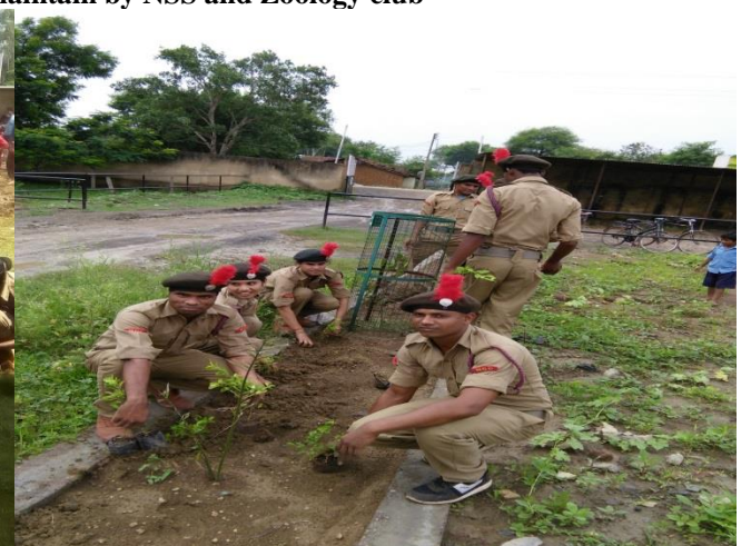
Fig.10-11 Garden maintain by NCC