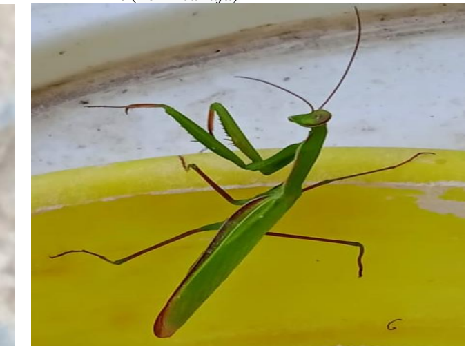
Praying mantis ( Mantis religiosa )