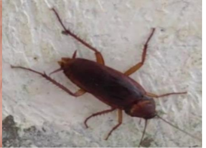
Cockroach ( Periplaneta americana )