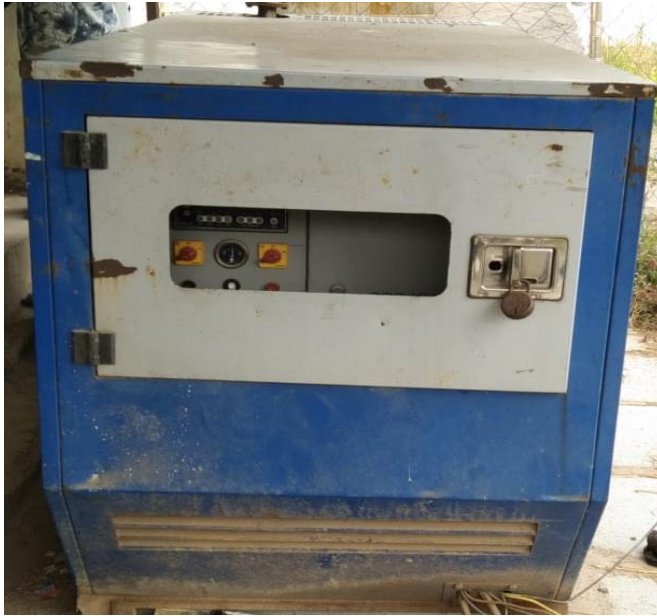
Fig. 15. Generetor set