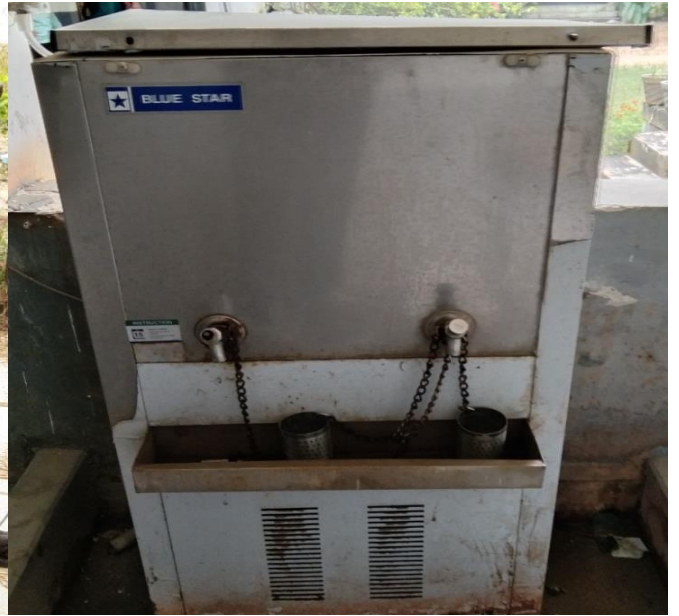
Fig. 16. Water purifier set