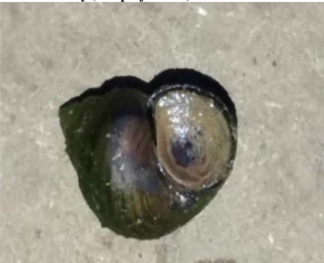
Pila ( Pilaglobosa )