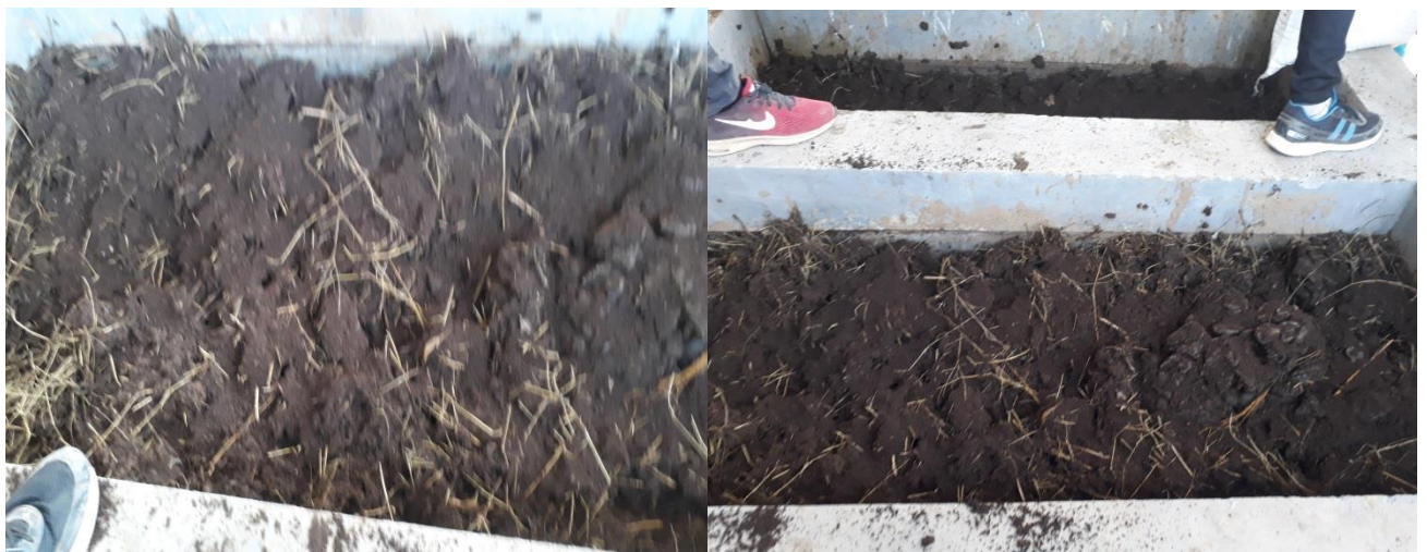
Fig. 12-13 Vermicomposting tanks located beside of sport department