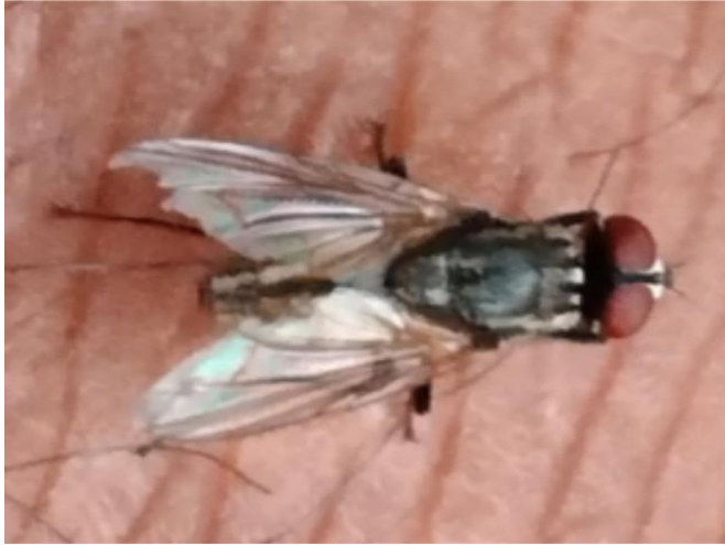
House fly ( Musca domestica )