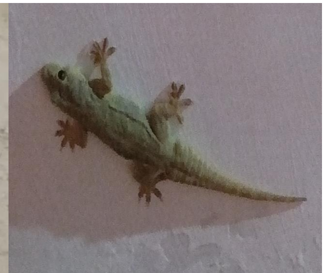
Lizard ( Hemidactylusfrenatus )