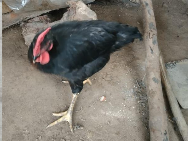
Hen ( Gallus gallusdomesticus )