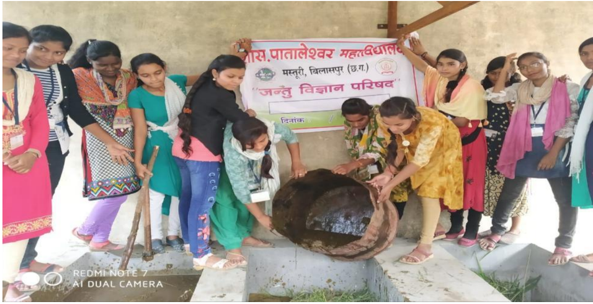
Vermicompost plant by Zoology Department