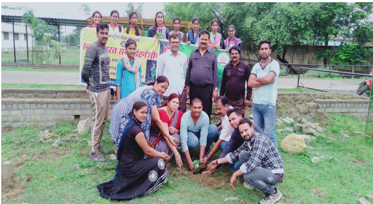
Tree plantation by NSS Unit of the College