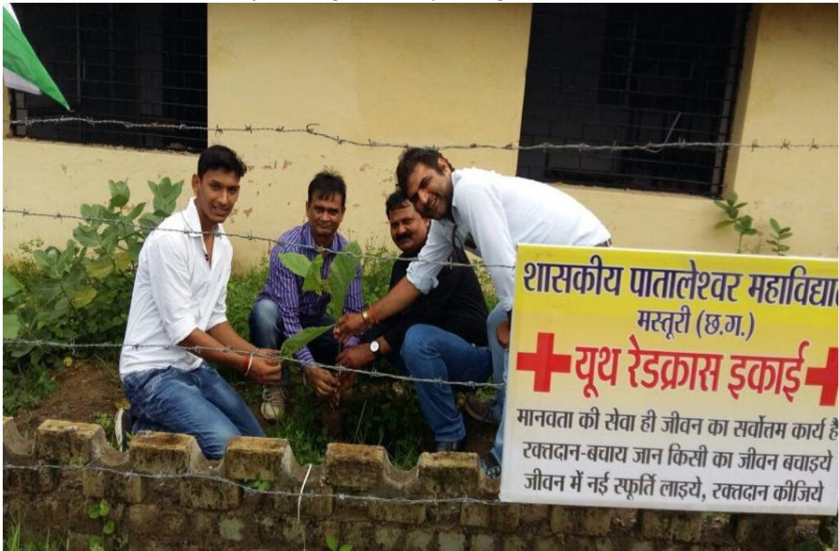
Front yard gardening by Youth Red cross & Commerce Dept.