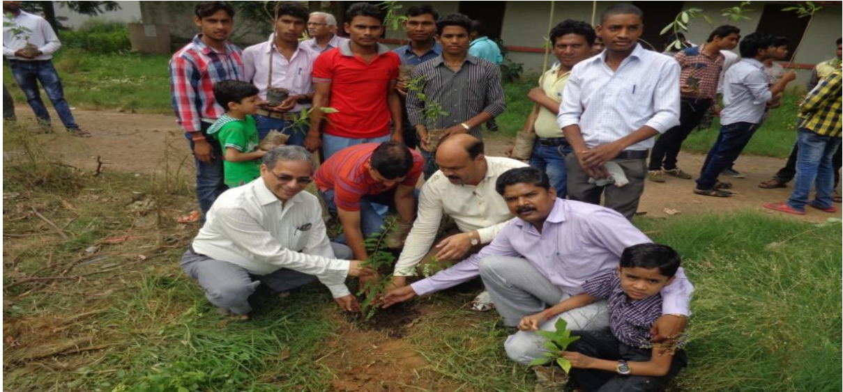
Tree Plantation Practice Through Eminent Guest