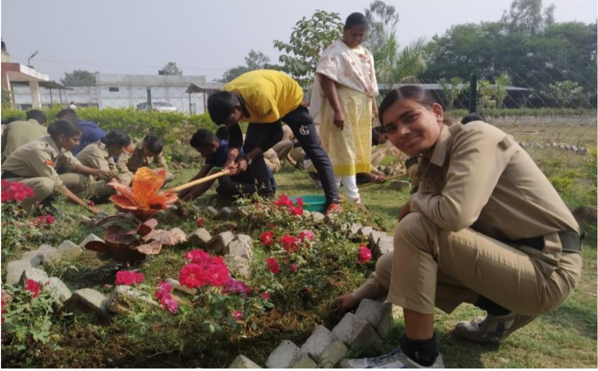
Self Funding Garden by College NCC Unit