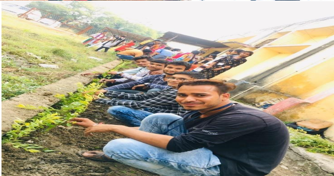
Plantation by Science club