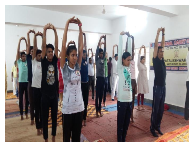
INTERNATIONAL YOGA DAY 21 JUNE 2019