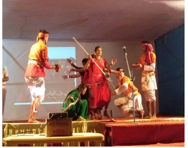
CULTURAL PRESENTATION DURING NIC CAMP