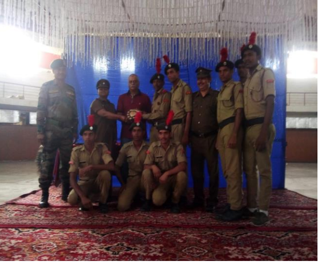
CATC CAMP: TENT PITCHING SHIELD FOR TWO CONSECUTIVE YEAR.