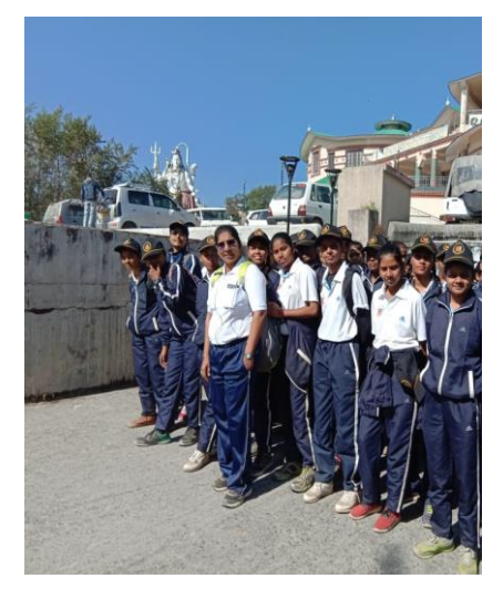
SW\ TREKKING\ CAMP\ NAMCHI,\ SIKKIM.\ MAHESHWARI\ \&\ ANNAPURNA