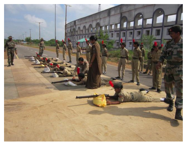
TENT PITCHING & FIRING DURING CAMP