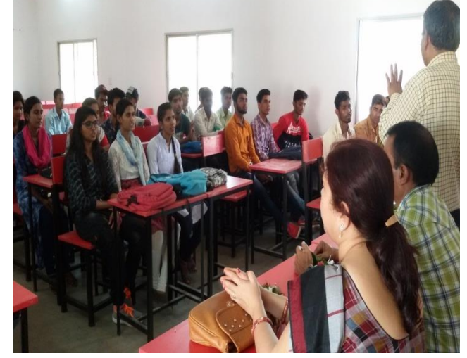
DRUGS ABUSE AND ILLICIT HUMAN TRAFFIKING- 26 JUNE 2019 AWARENESS SEMINAR