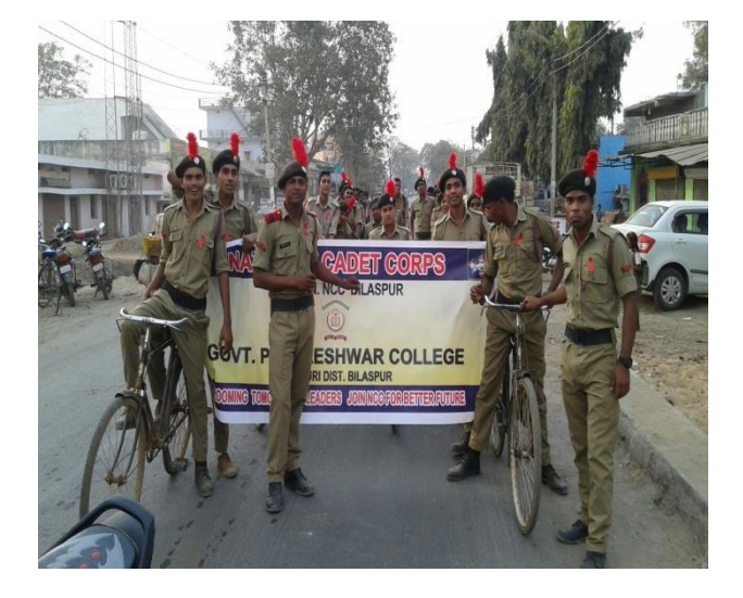
AIDS AWARENESS BICYCLE RALLY PUTTING ON SYMBOLIC RED RIBBON