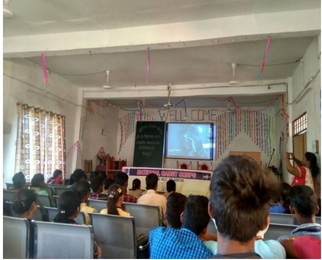
SURGICAL STRIKE DAY 28-30 SEP 2018 DOCUMENTARY VIDEO SHOWN TO CADETS