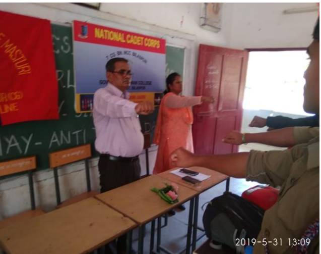
WORLD NO TOBACCO DAY, 31 MAY 2019; PLEDGE AGAINST TOBACCO CONSUMPTION