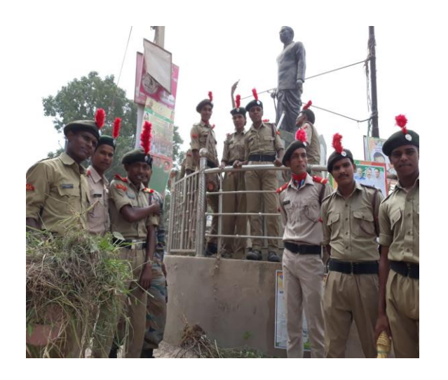
CLEANING PUBLIC STATUE DURING SWACHCHHATA PAKHWADA