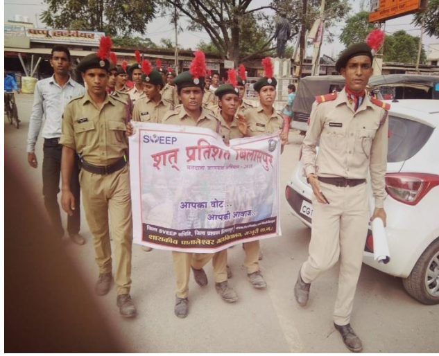
AWARENESS REGARDING 100% SUFFRAGE RIGHTS OBSERVATION.