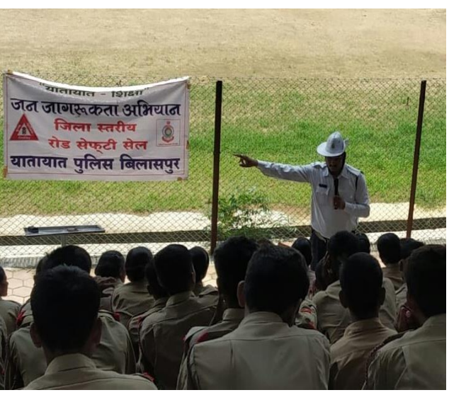
CATC CAMP- TRAFFIC RULES & ROAD SAFETYAWARENESS WORKSHOP