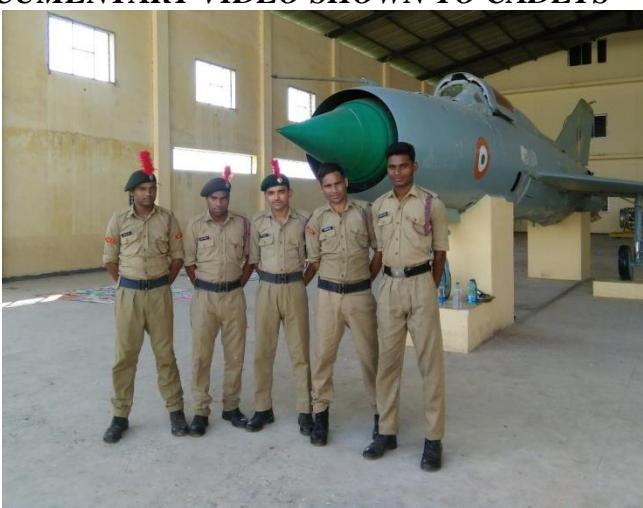
ARMY ATTACHMENT CAMP