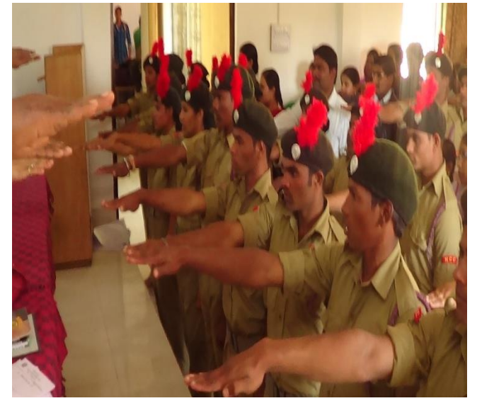
WATER CONSERVATION DAY 22 MARCH; PLEDGE TO SAVE EVERY DROP OF WATER