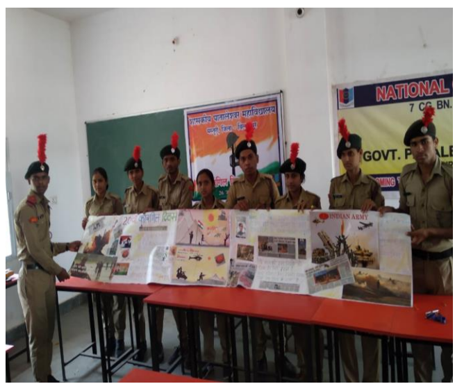
KARGIL VIJAY DIWAS: MOTIVATIONAL TALK, 26 JULY