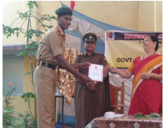
WINING MEDALS AND CERTIFICATES