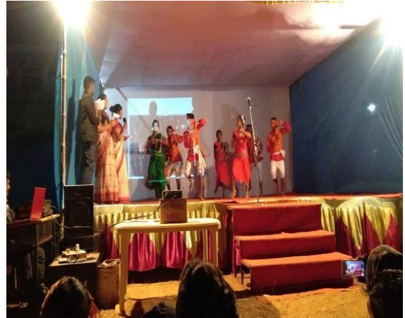
CULTURAL PROGRAM DURING NIC CAMP