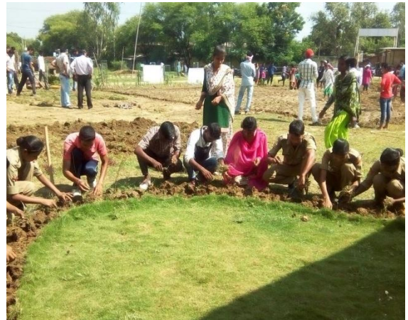
SELF-FUNDING GARDEN DEVELOPMENT INITIATIVE