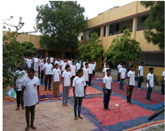
INTERNATIONAL YOGA DAY 21 JUNE 2017