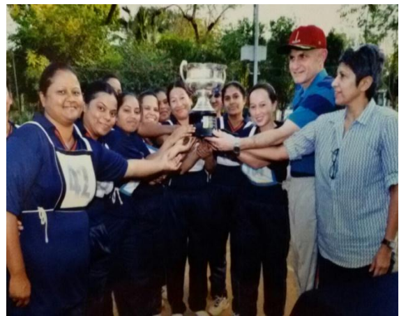
DURING PRCN COURSE, OTA GWALIOR & VOLLEY BALL WINNER TROPHY