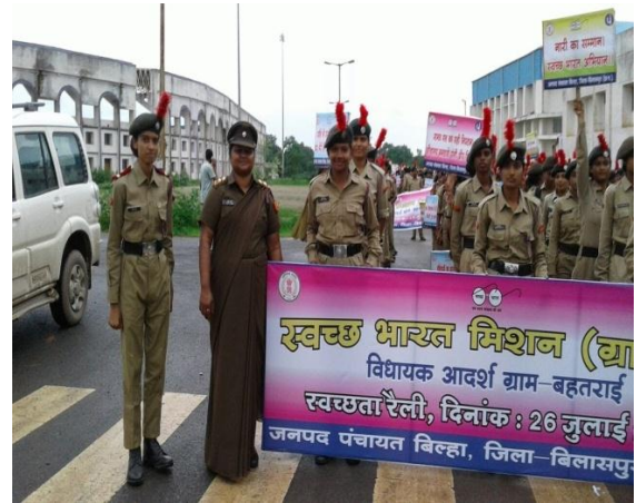
THE RED RIBBON AND SWACHCHHTA RALLY