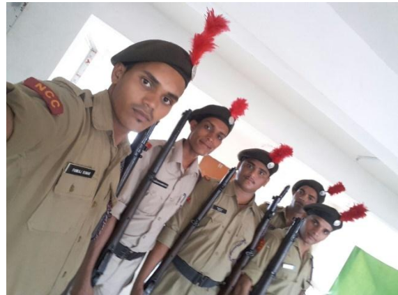
DURING THE CAMP