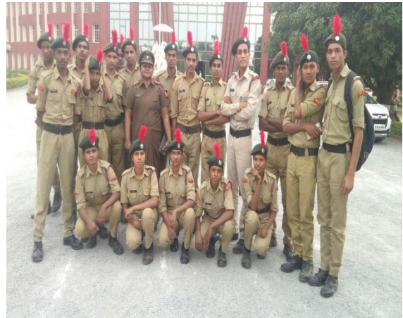
'C' & 'B' CERTIFICATE ASPIRANTS