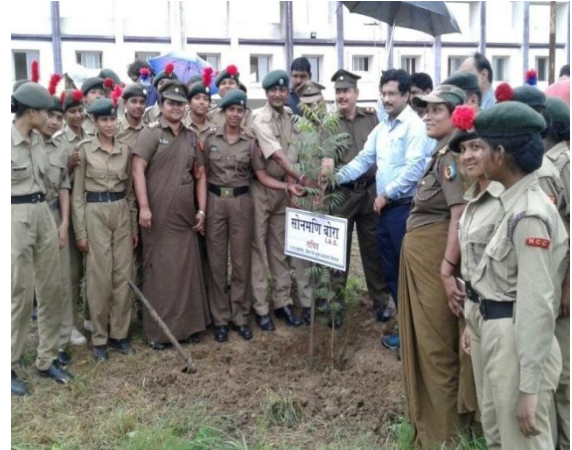
TREE PLANTATION DURING THE CAMP