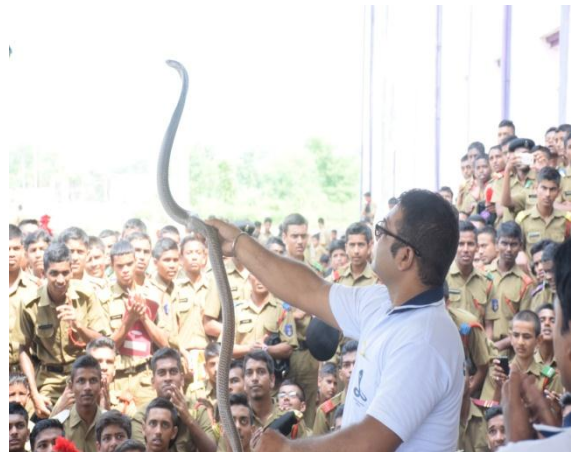
AWARENESS PROGRAM DURING THE CAMP