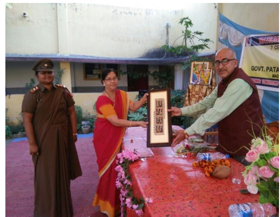
69 TH NCC DAY CELEBRATION