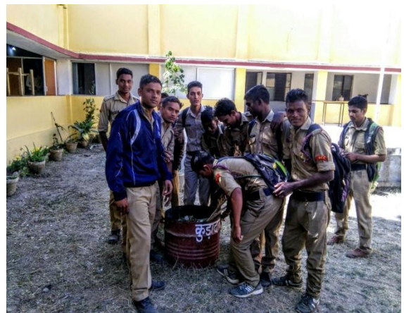
CAMPUS CLEANING DURING SWACHCHHATA PAKHWADA